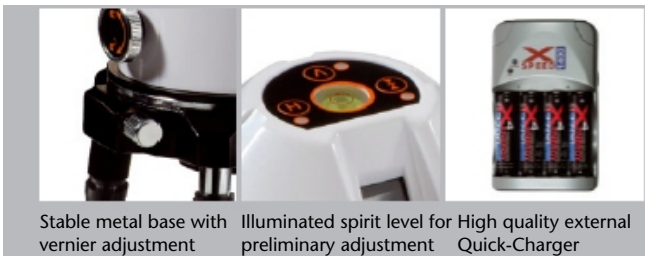
Stable metal base with vernier adjustment Illuminated spirit level for preliminary adjustment High quality external Quick-Charger